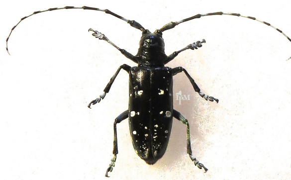
Asian longhorned beetle: 3/4-1.25" long, with very long black and white antennae. The body is glossy black with irregular white spots.