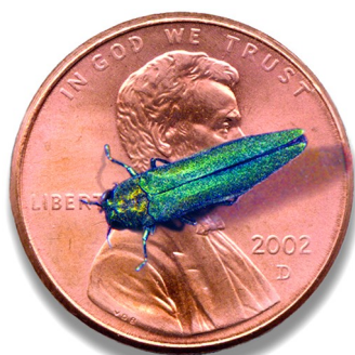
Emerald ash borer: 1/2" long and 1/8" wide, metallic green in color. Larvae are white 1 to 1 1/4" long and have 10 bell shaped abdominal segments.

To prevent the spread of these insects within the state and from outside states, travelers should be vigilant. First and foremost, never transport firewood outside of your immediate area, as many insects and pathogens can be hitching a ride. Secondly, always check for insects on items that will be moving outside of the county: boats, RVs, cars, ATVs, furniture, shoes, etc.