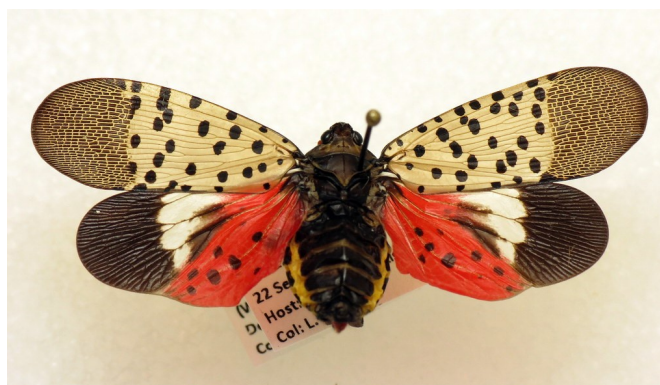
Spotted lanternfly: 4 stages of nymphs without wings, ranging from black with white spots to red with white spots. Adults are red, black, and white spotted with wings.

Gypsy moth: caterpillars are 2" long and have six pairs of rusty red spots along their backs. Female moths are white, 1-2" long and do not fly. Males are smaller than females and are brownish-gray.